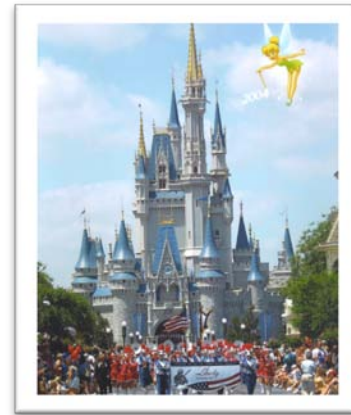
Disneyland Magic Kingdom!

Knott's Berry Farm* : with over 165 rides, shows and attractions, Knott's Berry Farm is the place to go for family fun! With five themed areas, there is something at Knott's for everyone. Experience world-class thrills on Silver Bullets, the park's first-ever suspended coaster, or Sierra Sidewinders - the spinning coaster that offers a panoramic view. Experience Knott's newest coaster Pony Express - The Rides, delivering a horseback relay at speeds never imagined in the Old West. For something different, detour to the Park's Old West Ghost Town® and have a cool sarsaparilla or visit Camp Snoopy, home of the PEANUTS gang and filled with dozens of kid-sized adventures.