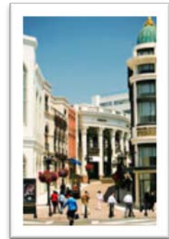
The famous Rodeo Drive!

Rodeo Drive: The famed street is known world-wide as an epicenter of luxury fashion. The stores of the famous Rodeo Drive span three blocks where visitors can enjoy more than 100 world renowned high end boutiques and hotels.